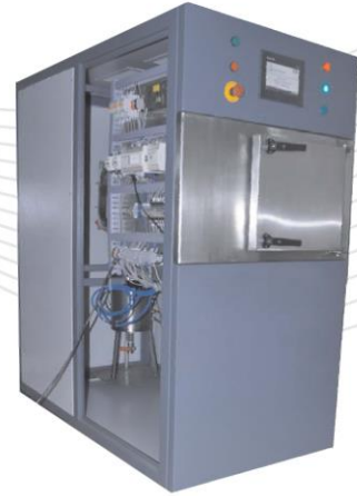
TABLE TOP ETO STERILIZER :